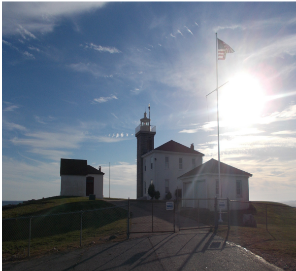
∞ (Watch Hill Lighthouse, NECB Staff)